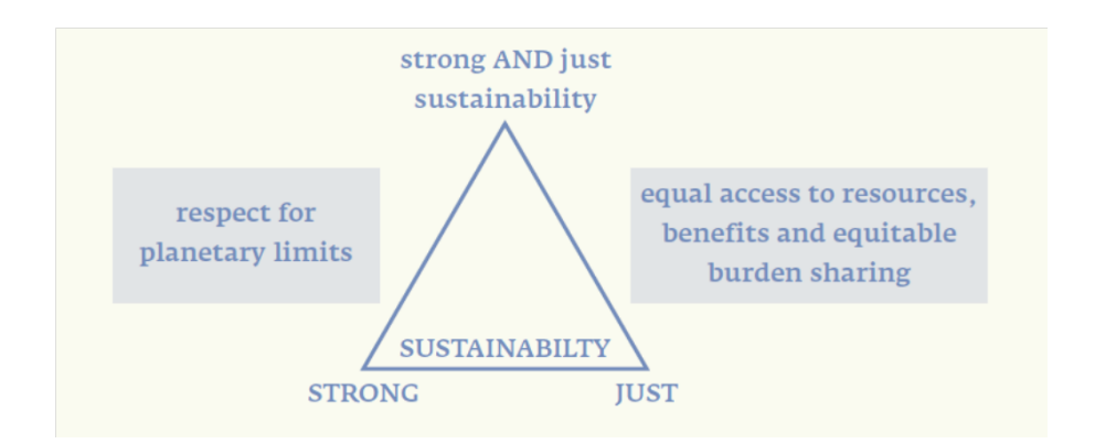
Figure 2: Framework and rationale for the CONVERGE project research (Vadovics and Milton 2013)