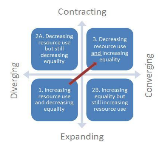
Figure 1: Schematic overview of the process of Convergence (Roderick in Vadovics and Milton 2012)

The aim of the FP7 EU-funded CONVERGE project was to 're-think globalisation' by developing the implications of a 'Convergence' approach to global development based on more equitable access to the life-support capacities of planet and fair livelihoods within planetary boundaries through a transdisciplinary systems approach (Fortnam et al. 2010). Convergence is defined as being a rights–based framework based on the principle that every global citizen has the right to a fair share of the Earth's biocapacity and access to fundamental human rights. It advocates socio-ecological justice and calls for wealth, well-being and consumption to converge across and within nations to a level that the biosphere can support (see Figure 1).